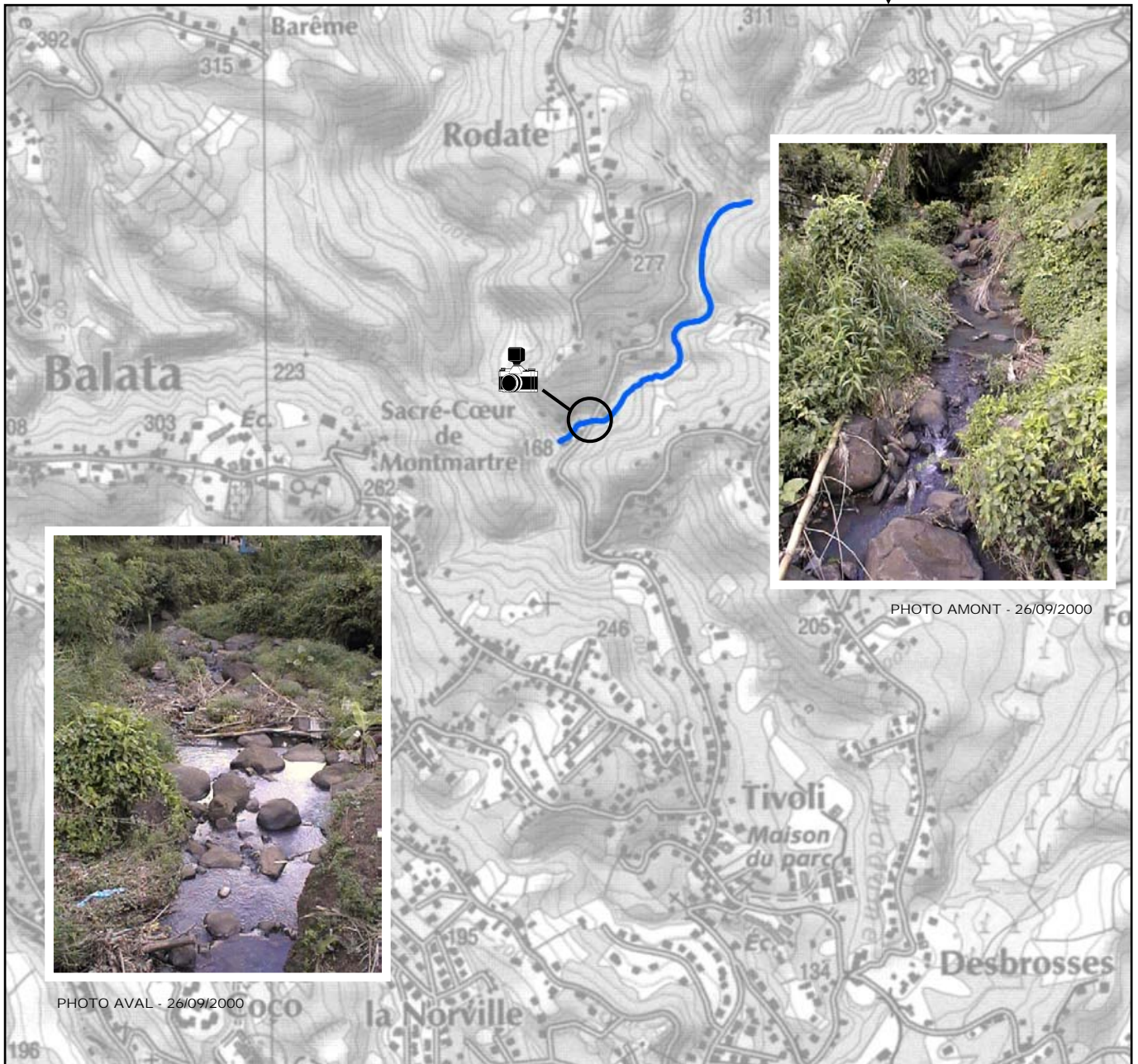
PHOTO AMONT - 26/09/2000